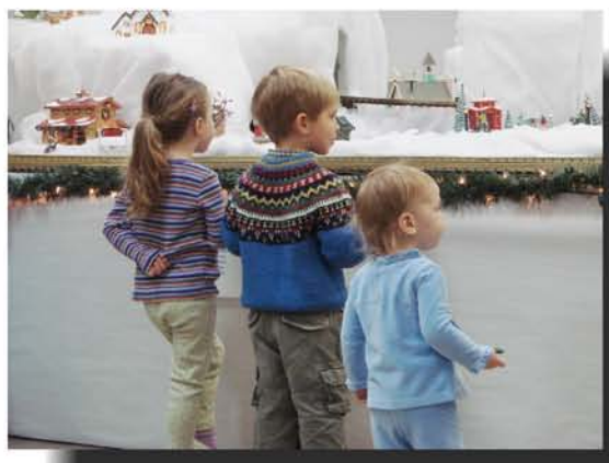
Here they come again !